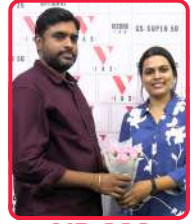
AIR 938 ALEKHYA