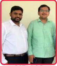
AIR 148 ASWIN