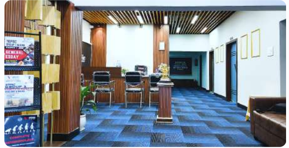
Opp Gandhi Nagar bus stop, Gandhi Nagar Road, Hyderabad,- 500080