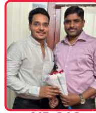
AIR 862 PRATHIK