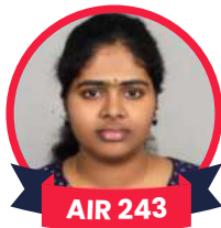
AIR 243 KASIRAJ SAHITYA