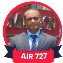
AIR 727 SHASHANK