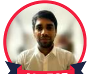
AIR 587 RAJINIKANTH