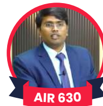
AIR 630 SAINATH