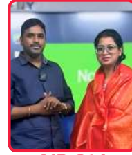
AIR 914 ANU PRIYA