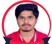
AIR 830 AADHA SANDEEP