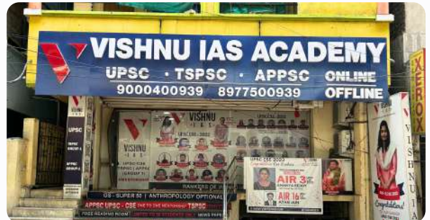
Ashok Nagar, Pillar No 23, Hyderabad - 500020