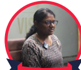
PAVANI Municipal Commissioner