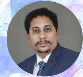
Shraavan sir 8+ years of Exp. Economy