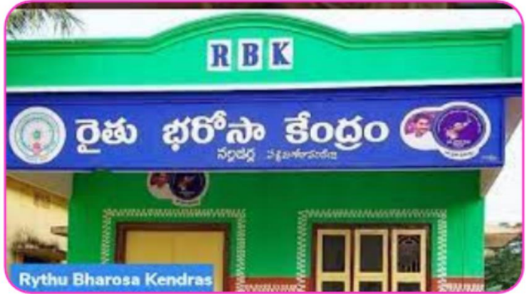
Ysr Rythu Bharosa Kendras