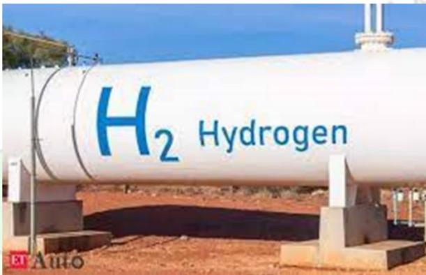
Green Hydrogen project