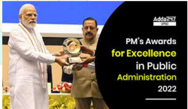
AP owns PM award