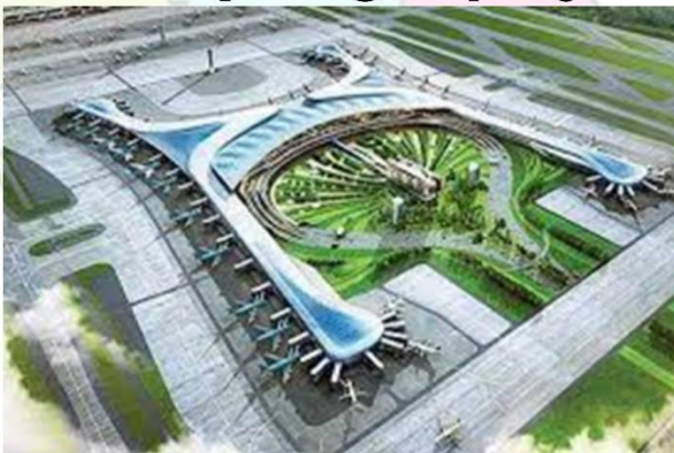
international airport in Bhogapuram