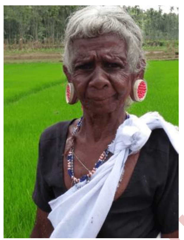
Paniya woman wearing choonthumani, a type of earring

The Paniya women also wear neckpieces made of beads of various colours. These neckpieces, ballikkale and panathaali , are of specific lengths. The panathaali is a piece of sacred jewellery that is worn only on auspicious occasions by women. Holes are made on the coins that the Paniya women receive for their labour, and these are strung together along with beads and worn as a neckpiece. The number of coins on the neckpiece suggest the amount of work that they did; the more the number, the more the work they have done. Mudechoolu is yet another type of neckpiece worn by the Paniya tribes. Today, there are not many women who wear these traditional pieces of jewellery, except one or two of the oldest. Some even have resorted to wearing modern jewellery, mostly bought from fancy stores in the town.