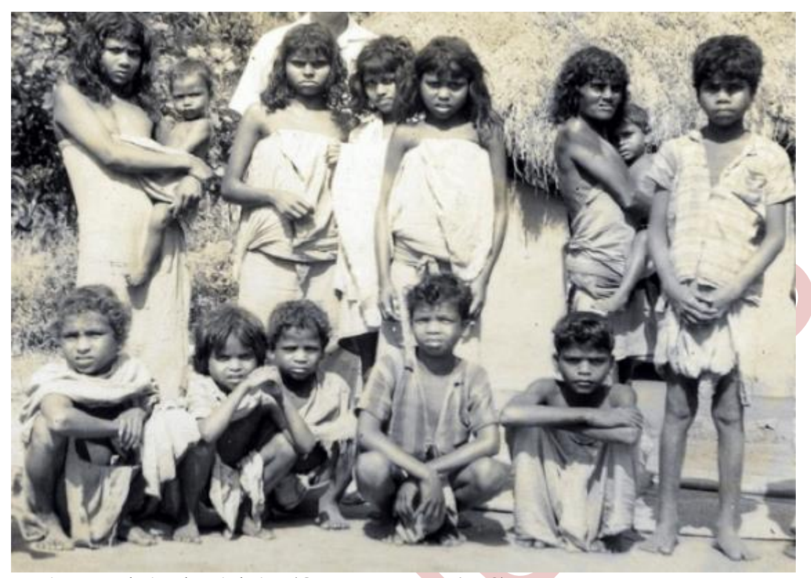
Paniya people in the eighties Origin of the Paniya Tribe

The Paniya tribe is found in Wayanad, Kannur, Kozhikode and Malappuram districts of Kerala, and adjoining districts of Coorg in Karnataka and the Nilgiris in Tamil Nadu. Majority of the entire Paniya population of South India inhabit in Wayanad. According to the Census of 2011, there are 15,876 families of Paniya in Wayanad, contributing to a population of 69,116.