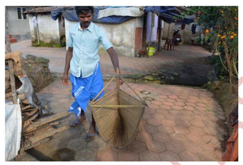
Paniya youth with an indigenous fishing trap Settlement of the Paniya Tribe

A Paniya's house is called pire or kudumbu . Traditionally the hut, or kudumbu, used to have walls made of mud and bamboo, and the roof was either made of bamboo or hay. A colony of Paniya houses is called a paadi , and many of these together form a karumam or a village.