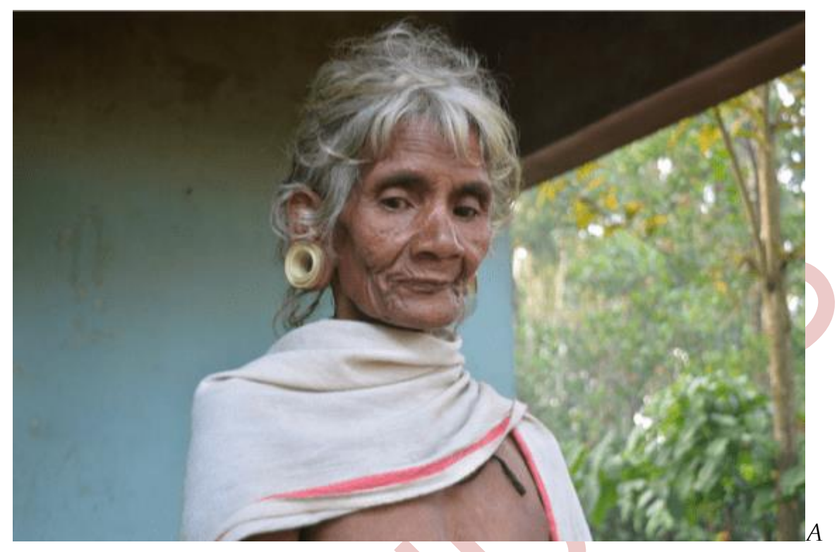
Paniya woman wearing a traditional oolay earring

Earrings, known as oolay , is very typical of the community. Another type of earring has lucky red seeds ( Adenanthera pavonina ), known as manjadikuru in Malayalam, stuck inside a ring of coconut palm leaf using beeswax or gum from jackfruit tree. The ear is pierced to fit the size of the ring or ooda . This particular kind of earring is called a choonthumani .