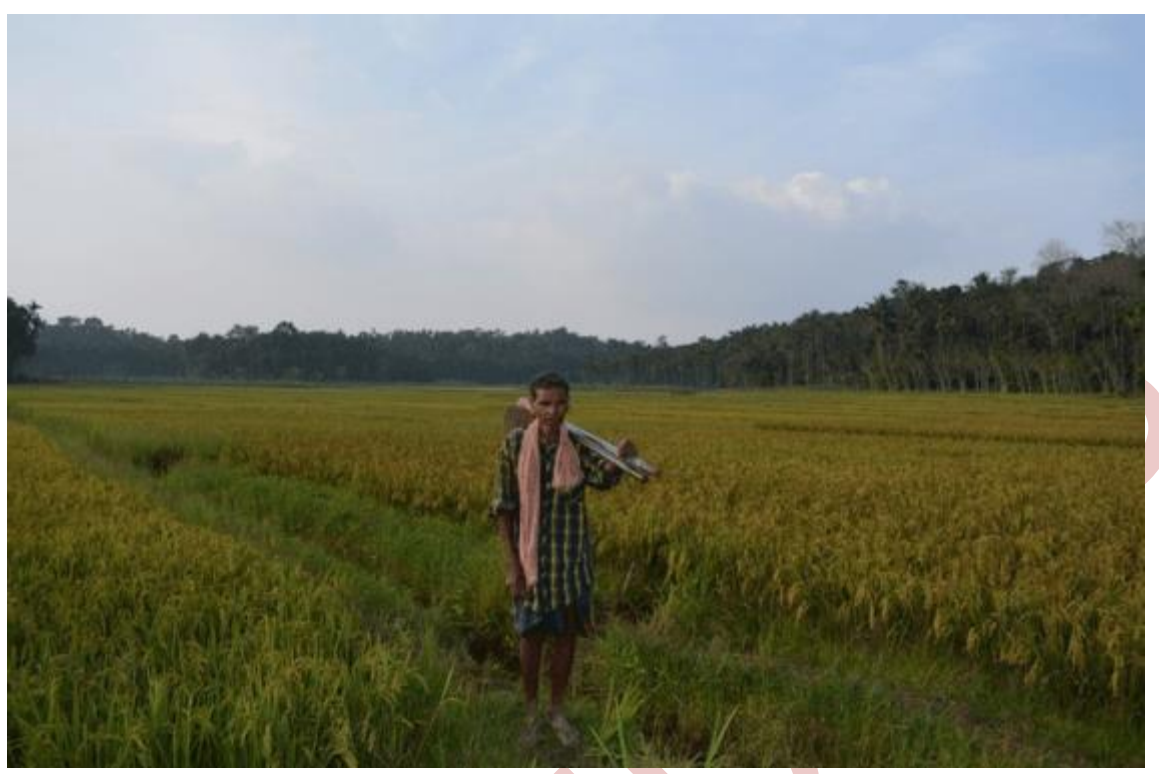
A Paniya agricultural labourer from Kottathara, Wayanad

This system of bonded labour came to an end in 1975 with the abolition of the same by the Kerala state government. Today, though the Paniyas still work in the fields of landed farmers, they are wage labourers working on agricultural fields of landholding farmers near their tribal colonies. The men get paid about 600 INR for the work they do, while the women only get 350 INR. In addition to being agricultural labourers, they also have the option of being part of the Mahatma Gandhi National Rural Employment Guarantee Programme, where an individual in a household gets employment for 100 days or more or taking up odd jobs for the village community nearby. The Paniya women work as maid-servants in the houses of farmers living close to their tribal colonies.